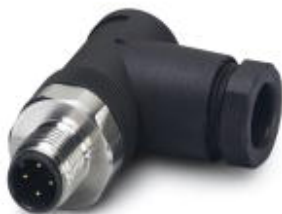
Sensor/actuator connector, male, angled, 4-pos., M12, screw connection, high-grade steel knurl, cable screw connection Pg9

Please be informed that the data shown in this PDF Document is generated from our Online Catalog. Please find the complete data in the user's documentation. Our General Terms of Use for Downloads are valid ( http://phoenixcontact.com/download )