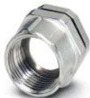
M12 SPEEDCON housing screw connection for M12 female inserts, with O-ring, for all SPEEDCON-capable THR and wave soldering contact carriers

Please be informed that the data shown in this PDF Document is generated from our Online Catalog. Please find the complete data in the user's documentation. Our General Terms of Use for Downloads are valid ( http://phoenixcontact.com/download )