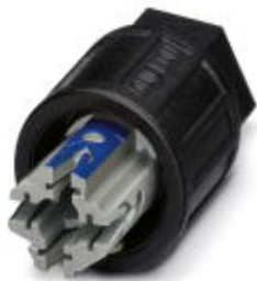
QUICKON set for replacement purposes, consisting of splice ring, pressure nut and line seal

Please be informed that the data shown in this PDF Document is generated from our Online Catalog. Please find the complete data in the user's documentation. Our General Terms of Use for Downloads are valid ( http://phoenixcontact.com/download )