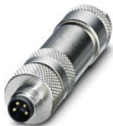
Connector, 4-position, shielded, Plug straight M8, A-coded, Screw connection, Knurl material: Nickel-plated brass, External cable diameter 3.5 mm ... 5.5 mm

Please be informed that the data shown in this PDF Document is generated from our Online Catalog. Please find the complete data in the user's documentation. Our General Terms of Use for Downloads are valid ( http://phoenixcontact.com/download )