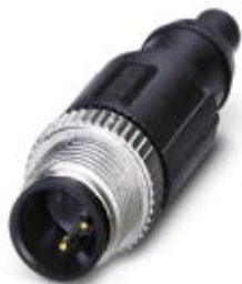
Short-circuit plug, for bridging unused slots on PSR-SACB sensor box for safety limit switch

Please be informed that the data shown in this PDF Document is generated from our Online Catalog. Please find the complete data in the user's documentation. Our General Terms of Use for Downloads are valid ( http://phoenixcontact.com/download )