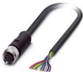
Master cable, 12-position, PUR/PVC, black RAL 9005, free cable end, on Socket straight M12, A-coded, Cable length: 5 m

Please be informed that the data shown in this PDF Document is generated from our Online Catalog. Please find the complete data in the user's documentation. Our General Terms of Use for Downloads are valid ( http://phoenixcontact.com/download )