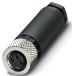
Connector, 3-position, Socket straight M8, A-coded, Screw connection, Knurl material: Nickel-plated brass, External cable diameter 3.5 mm ... 5 mm

Please be informed that the data shown in this PDF Document is generated from our Online Catalog. Please find the complete data in the user's documentation. Our General Terms of Use for Downloads are valid ( http://phoenixcontact.com/download )