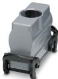
HEAVYCON B24 coupling housing, with double locking latch, height: 81.5 mm, with 1 x M40 thread, straight cable outlet

Please be informed that the data shown in this PDF Document is generated from our Online Catalog. Please find the complete data in the user's documentation. Our General Terms of Use for Downloads are valid ( http://phoenixcontact.com/download )