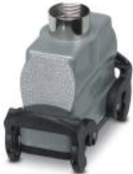
HEAVYCON B24 coupling housing, with double locking latch, height: 81.5 mm, with 1 x Pg29 gland, straight cable outlet

Please be informed that the data shown in this PDF Document is generated from our Online Catalog. Please find the complete data in the user's documentation. Our General Terms of Use for Downloads are valid ( http://phoenixcontact.com/download )