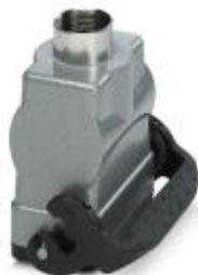
HEAVYCON B10 coupling housing, with single locking latch, height: 77.5 mm, with 1 x Pg29 gland, straight cable outlet

Please be informed that the data shown in this PDF Document is generated from our Online Catalog. Please find the complete data in the user's documentation. Our General Terms of Use for Downloads are valid ( http://phoenixcontact.com/download )