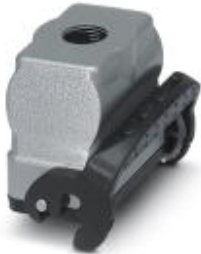
HEAVYCON B6 coupling housing, with single locking latch, height: 77.5 mm, with 1 x M25 thread, straight cable outlet

Please be informed that the data shown in this PDF Document is generated from our Online Catalog. Please find the complete data in the user's documentation. Our General Terms of Use for Downloads are valid ( http://phoenixcontact.com/download )