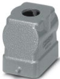
HEAVYCON B6 sleeve housing, for single locking latch, height: 56 mm, with 1 x M25 thread, straight cable outlet

Please be informed that the data shown in this PDF Document is generated from our Online Catalog. Please find the complete data in the user's documentation. Our General Terms of Use for Downloads are valid ( http://phoenixcontact.com/download )