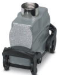
HEAVYCON B24 coupling housing, with double locking latch, height: 70.5 mm, with 1 x Pg29 gland, straight cable outlet

Please be informed that the data shown in this PDF Document is generated from our Online Catalog. Please find the complete data in the user's documentation. Our General Terms of Use for Downloads are valid ( http://phoenixcontact.com/download )