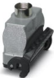
HEAVYCON B24 coupling housing, with single locking latch, height: 70.5 mm, with 1 x Pg29 gland, straight cable outlet

Please be informed that the data shown in this PDF Document is generated from our Online Catalog. Please find the complete data in the user's documentation. Our General Terms of Use for Downloads are valid ( http://phoenixcontact.com/download )