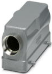
HEAVYCON B24 sleeve housing, for double locking latch, height: 65 mm, with 1 x Pg21 gland, lateral cable outlet

Please be informed that the data shown in this PDF Document is generated from our Online Catalog. Please find the complete data in the user's documentation. Our General Terms of Use for Downloads are valid ( http://phoenixcontact.com/download )