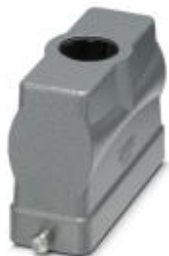
HEAVYCON B24 sleeve housing, for single locking latch, height: 76 mm, with 1 x M40 thread, straight cable outlet

Please be informed that the data shown in this PDF Document is generated from our Online Catalog. Please find the complete data in the user's documentation. Our General Terms of Use for Downloads are valid ( http://phoenixcontact.com/download )