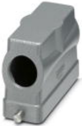
HEAVYCON B24 sleeve housing, for single locking latch, height: 76 mm, with 1 x M32 thread, lateral cable outlet

Please be informed that the data shown in this PDF Document is generated from our Online Catalog. Please find the complete data in the user's documentation. Our General Terms of Use for Downloads are valid ( http://phoenixcontact.com/download )