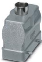
HEAVYCON B16 sleeve housing, for double locking latch, height: 76 mm, with 1 x Pg29 gland, straight cable outlet

Please be informed that the data shown in this PDF Document is generated from our Online Catalog. Please find the complete data in the user's documentation. Our General Terms of Use for Downloads are valid ( http://phoenixcontact.com/download )