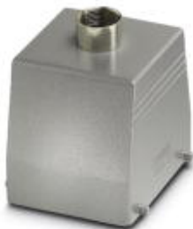
HEAVYCON B32 sleeve housing, for double locking latch, height: 80 mm, with 1 x Pg36 gland, straight cable outlet

Please be informed that the data shown in this PDF Document is generated from our Online Catalog. Please find the complete data in the user's documentation. Our General Terms of Use for Downloads are valid ( http://phoenixcontact.com/download )