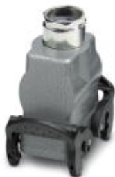
HEAVYCON B16 coupling housing, with double locking latch, height: 70.5 mm, with 1 x M25 thread, straight cable outlet

Please be informed that the data shown in this PDF Document is generated from our Online Catalog. Please find the complete data in the user's documentation. Our General Terms of Use for Downloads are valid ( http://phoenixcontact.com/download )