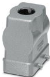
HEAVYCON B10 sleeve housing, for double locking latch, height: 72 mm, with 1 x M32 thread, straight cable outlet

Please be informed that the data shown in this PDF Document is generated from our Online Catalog. Please find the complete data in the user's documentation. Our General Terms of Use for Downloads are valid ( http://phoenixcontact.com/download )