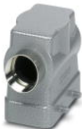
HEAVYCON B10 sleeve housing, for double locking latch, height: 72 mm, with 1 x Pg29 gland, lateral cable outlet

Please be informed that the data shown in this PDF Document is generated from our Online Catalog. Please find the complete data in the user's documentation. Our General Terms of Use for Downloads are valid ( http://phoenixcontact.com/download )