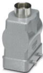
HEAVYCON B10 sleeve housing, for double locking latch, height: 72 mm, with 1 x Pg21 gland, straight cable outlet

Please be informed that the data shown in this PDF Document is generated from our Online Catalog. Please find the complete data in the user's documentation. Our General Terms of Use for Downloads are valid ( http://phoenixcontact.com/download )