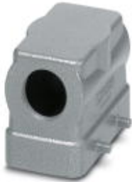
HEAVYCON B10 sleeve housing, for double locking latch, height: 56 mm, with 1 x M25 thread, lateral cable outlet

Please be informed that the data shown in this PDF Document is generated from our Online Catalog. Please find the complete data in the user's documentation. Our General Terms of Use for Downloads are valid ( http://phoenixcontact.com/download )