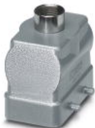
HEAVYCON B10 sleeve housing, for double locking latch, height: 56 mm, with 1 x Pg16 gland, straight cable outlet

Please be informed that the data shown in this PDF Document is generated from our Online Catalog. Please find the complete data in the user's documentation. Our General Terms of Use for Downloads are valid ( http://phoenixcontact.com/download )