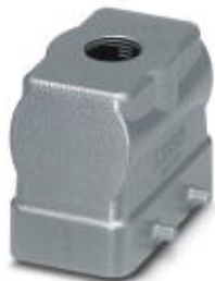
HEAVYCON B10 sleeve housing, for double locking latch, height: 56 mm, with 1 x M20 thread, straight cable outlet

Please be informed that the data shown in this PDF Document is generated from our Online Catalog. Please find the complete data in the user's documentation. Our General Terms of Use for Downloads are valid ( http://phoenixcontact.com/download )