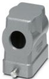
HEAVYCON B10 sleeve housing, for single locking latch, height: 72 mm, with 1 x M25 thread, lateral cable outlet

Please be informed that the data shown in this PDF Document is generated from our Online Catalog. Please find the complete data in the user's documentation. Our General Terms of Use for Downloads are valid ( http://phoenixcontact.com/download )