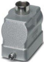
HEAVYCON B10 sleeve housing, for single locking latch, height: 56 mm, with 1 x Pg16 gland, straight cable outlet

Please be informed that the data shown in this PDF Document is generated from our Online Catalog. Please find the complete data in the user's documentation. Our General Terms of Use for Downloads are valid ( http://phoenixcontact.com/download )