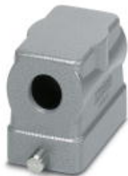
HEAVYCON B10 sleeve housing, for single locking latch, height: 56 mm, with 1 x M20 thread, lateral cable outlet

Please be informed that the data shown in this PDF Document is generated from our Online Catalog. Please find the complete data in the user's documentation. Our General Terms of Use for Downloads are valid ( http://phoenixcontact.com/download )