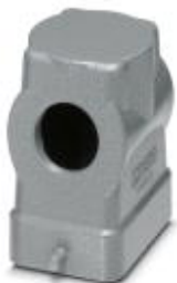
HEAVYCON B6 sleeve housing, for single locking latch, height: 72 mm, with 1 x M25 thread, lateral cable outlet

Please be informed that the data shown in this PDF Document is generated from our Online Catalog. Please find the complete data in the user's documentation. Our General Terms of Use for Downloads are valid ( http://phoenixcontact.com/download )