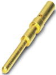
Crimp contact, diameter 0.8 mm, for the 8-pos. contact insert, crimp range from 0.08 mm 2 - 0.34 mm 2 .

Please be informed that the data shown in this PDF Document is generated from our Online Catalog. Please find the complete data in the user's documentation. Our General Terms of Use for Downloads are valid ( http://phoenixcontact.com/download )