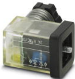
Valve connector, 3-pos., construction CI, 1 LED, with protective circuit, screw connection, M12 cable gland

Please be informed that the data shown in this PDF Document is generated from our Online Catalog. Please find the complete data in the user's documentation. Our General Terms of Use for Downloads are valid ( http://phoenixcontact.com/download )