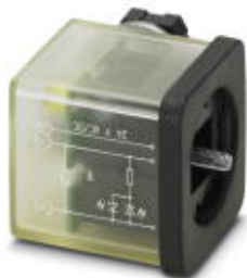
Valve connector, 3-pos., type A, 1 LED, with protective circuit, screw connection, cable screw connection M16

Please be informed that the data shown in this PDF Document is generated from our Online Catalog. Please find the complete data in the user's documentation. Our General Terms of Use for Downloads are valid ( http://phoenixcontact.com/download )