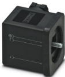
Valve connector, 3-pos., construction A, without protective circuit, screw connection, M16 cable gland

Please be informed that the data shown in this PDF Document is generated from our Online Catalog. Please find the complete data in the user's documentation. Our General Terms of Use for Downloads are valid ( http://phoenixcontact.com/download )