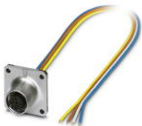
Sensor/actuator flush-type socket, 4-pos., M12, D-coded, front/square flange mounting, with 0.5 m TPE litz wire, 4 x 0.34 mm 2

Please be informed that the data shown in this PDF Document is generated from our Online Catalog. Please find the complete data in the user's documentation. Our General Terms of Use for Downloads are valid ( http://phoenixcontact.com/download )