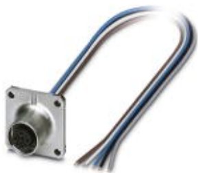
Sensor/actuator flush-type socket, 5-pos., M12, B-coded, front/square flange mounting, with 0.5 m TPE litz wire, 5 x 0.34 mm 2

Please be informed that the data shown in this PDF Document is generated from our Online Catalog. Please find the complete data in the user's documentation. Our General Terms of Use for Downloads are valid ( http://phoenixcontact.com/download )