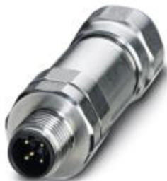
Connector, 5-position, shielded, Plug straight M12, B-coded, Screw connection, Knurl material: High-grade steel, External cable diameter 5.5 mm ... 8.6 mm

Please be informed that the data shown in this PDF Document is generated from our Online Catalog. Please find the complete data in the user's documentation. Our General Terms of Use for Downloads are valid ( http://phoenixcontact.com/download )