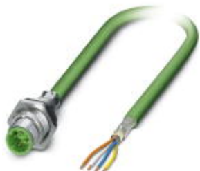
Bus system flush-type plug, PROFINET, 4-pos., M12, shielded, D-coded, SPEEDCON, rear/screw mounting with Pg9 thread, with 2.0 m bus cable, 2 x 2 x 0.34 mm 2

Please be informed that the data shown in this PDF Document is generated from our Online Catalog. Please find the complete data in the user's documentation. Our General Terms of Use for Downloads are valid ( http://phoenixcontact.com/download )