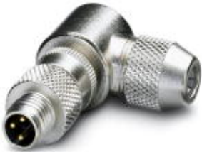
Connector, 3-position, shielded, Plug angled M8, A-coded, Solder connection, Knurl material: Nickel-plated brass, External cable diameter 3.5 mm ... 5 mm

Please be informed that the data shown in this PDF Document is generated from our Online Catalog. Please find the complete data in the user's documentation. Our General Terms of Use for Downloads are valid ( http://phoenixcontact.com/download )