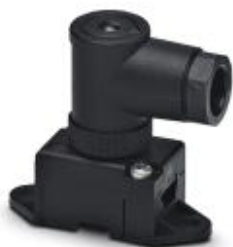
AS-Interface distributor with IP67 protection for 1 flat-ribbon conductor, 2-pos., with screw connection, angled

Please be informed that the data shown in this PDF Document is generated from our Online Catalog. Please find the complete data in the user's documentation. Our General Terms of Use for Downloads are valid ( http://phoenixcontact.com/download )