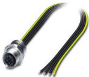
Flush-type connector, Power, 4-position, SocketLink:M12, S power, Front mounting, M16 x 1.5, Individual wires, Cable length: 0.5 m

Please be informed that the data shown in this PDF Document is generated from our Online Catalog. Please find the complete data in the user's documentation. Our General Terms of Use for Downloads are valid ( http://phoenixcontact.com/download )