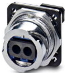
SC-RJ panel mounting frame, IP67, for bayonet interlocking, metal, with coupling for single mode, SC-RJ on 2xSC, for round mounting cutout, with seal, without mounting screws

Please be informed that the data shown in this PDF Document is generated from our Online Catalog. Please find the complete data in the user's documentation. Our General Terms of Use for Downloads are valid ( http://phoenixcontact.com/download )