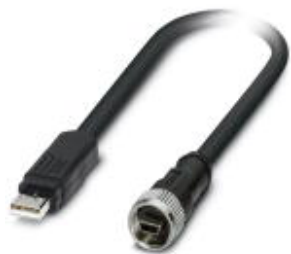
Assembled USB cable, shielded, color: black, PVC outer sheath, USB mini-B/IP20 on USB type A/IP20, length: 5 m

Please be informed that the data shown in this PDF Document is generated from our Online Catalog. Please find the complete data in the user's documentation. Our General Terms of Use for Downloads are valid ( http://phoenixcontact.com/download )