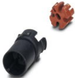
5-pos. contact carrier, with splice ring, A-coded

Please be informed that the data shown in this PDF Document is generated from our Online Catalog. Please find the complete data in the user's documentation. Our General Terms of Use for Downloads are valid ( http://phoenixcontact.com/download )