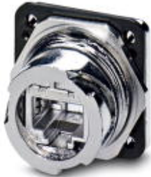
RJ45 mounting frame, IP67, for bayonet interlocking, metal, with socket-socket contact insert, for round mounting cutout, with seal, without mounting screws

Please be informed that the data shown in this PDF Document is generated from our Online Catalog. Please find the complete data in the user's documentation. Our General Terms of Use for Downloads are valid ( http://phoenixcontact.com/download )