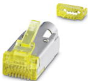
Male insert RJ45, CAT6 A , 10 Gigabit

Please be informed that the data shown in this PDF Document is generated from our Online Catalog. Please find the complete data in the user's documentation. Our General Terms of Use for Downloads are valid ( http://phoenixcontact.com/download )