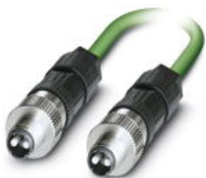
Assembled FO cable, round cable, 200/230 µm PCF-GI fiber, M12 to M12, for installation inside buildings, length: 5 m

Please be informed that the data shown in this PDF Document is generated from our Online Catalog. Please find the complete data in the user's documentation. Our General Terms of Use for Downloads are valid ( http://phoenixcontact.com/download )