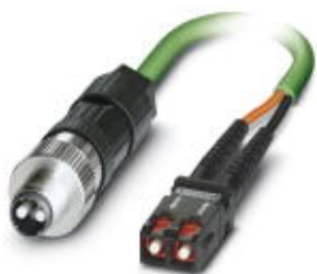
PCF-GI cable, assembled with M12 connector to SC-RJ

Please be informed that the data shown in this PDF Document is generated from our Online Catalog. Please find the complete data in the user's documentation. Our General Terms of Use for Downloads are valid ( http://phoenixcontact.com/download )