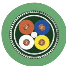
PROFINET robot CAT5 [93R]