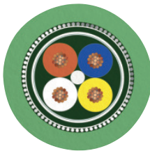
PROFINET robot CAT5 [93R]